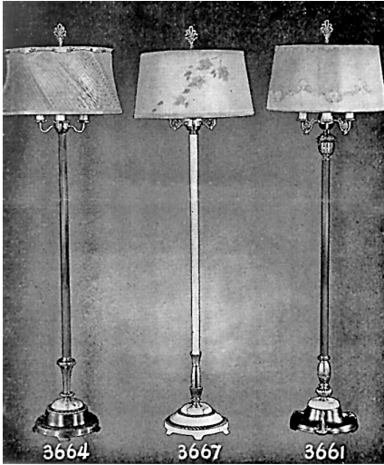
Design No. 3664

Illustrated above is a reflector lamp fitted with a 3-way mogul switch in glass reflector bowl for indirect lighting and 3-candle fixture for direct use; also night light in base, making 7 degrees of light in all. Finished in Oxidized Bronze, Ivory and Gold with beautiful imitation Onyx Base. Shade shown: 19-inch diagonal pleated silk No. R375.